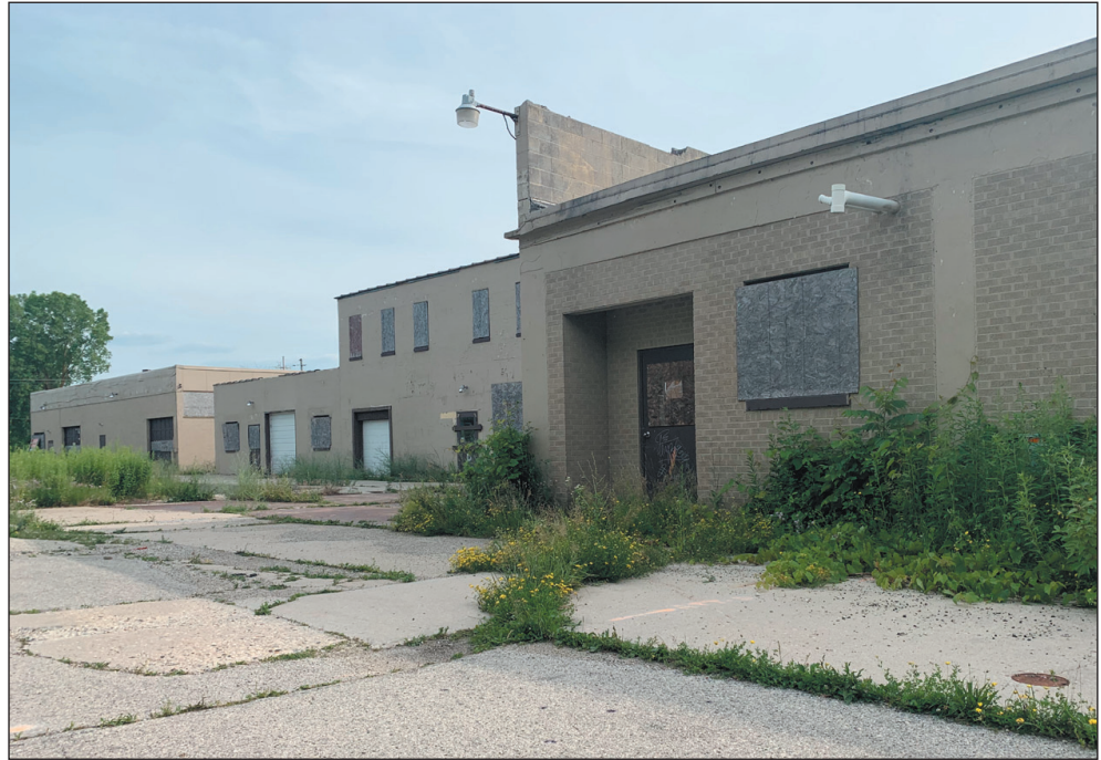
Kendra Lamer/Daily News Staff

The city issued a raze order on September 15, 2015, and Washington County Circuit Court deemed the order valid and enforceable on July 24, 2019, allowing the city to raze the property.